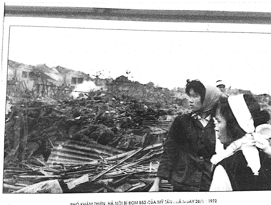
Kham Thien Street after being bombed on December 26.