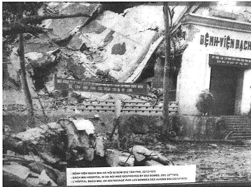
Bach Mai Hospital after being bombed on December 22